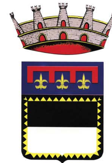
Comune di Cesena

Additionally, the Sustainable Energy Action Plan, drafted in 2011 following the endorsement of the Covenant of Mayors, considered the energy retrofitting of existing buildings and construction according to energy class A, as priority actions. The challenge is therefore reaching nearly zero energy through the Passive House Standard supplied with renewables in line with the targets set by the EU for 2021, both in the residential housing and commercial/services sectors. This will surely require the involvement of all relevant stakeholders. In addition to the building of the Case Finali project, Cesena has begun with a variety of informational events and trainings.